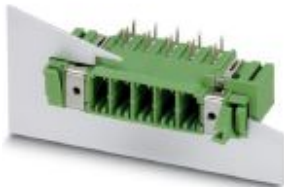
The figure shows a 5-pos. version of the product

Feed-through header, nominal current: 41 A, rated voltage (III/2): 630 V, nominal cross section: 6 mm 2 , number of positions: 5, pitch: 7.62 mm, color: green, contact surface: Tin, mounting: Wave soldering, pin layout: Linear pinning, solder pin [P]: 4.26 mm