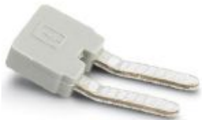
The figure shows the 2-position version

Insertion bridge for connectors with 5.0 mm or 5.08 mm pitch