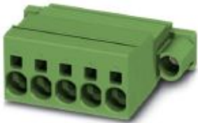
The figure shows a 5-pos. version of the product

PCB connector, nominal current: 41 A, rated voltage (III/2): 1000 V, nominal cross section: 6 mm 2 , number of positions: 4, pitch: 7.62 mm, connection method: Push-in spring connection, color: green, contact surface: Tin