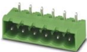
Figure shows the standard item

PCB headers, nominal cross section: 2.5 mm 2 , number of positions: 2, pitch: 5 mm, color: green, contact surface: Tin, mounting: Wave soldering, pin layout: Linear pinning, solder pin [P]: 3.5 mm