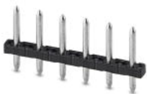
The figure shows a 6-position version

Please be informed that the data shown in this PDF Document is generated from our Online Catalog. Please find the complete data in the user's documentation. Our General Terms of Use for Downloads are valid ( http://phoenixcontact.com/download )