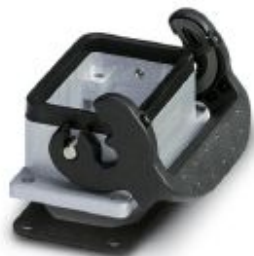
HEAVYCON B6 panel mounting base, with single locking latch, height: 29 mm, with flat gasket

Please be informed that the data shown in this PDF Document is generated from our Online Catalog. Please find the complete data in the user's documentation. Our General Terms of Use for Downloads are valid ( http://phoenixcontact.com/download )