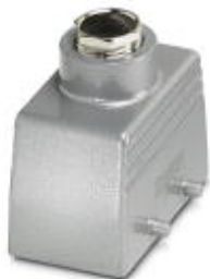
Sleeve housing, for double locking latch, height 45 mm, with screw connection, 1x Pg16, straight cable entry

Please be informed that the data shown in this PDF Document is generated from our Online Catalog. Please find the complete data in the user's documentation. Our General Terms of Use for Downloads are valid ( http://phoenixcontact.com/download )