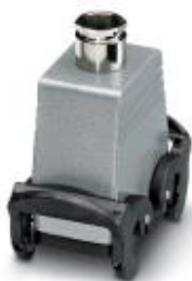
Coupling housing, with double locking latch, height 73 mm, with screw connection, 1x Pg16

Please be informed that the data shown in this PDF Document is generated from our Online Catalog. Please find the complete data in the user's documentation. Our General Terms of Use for Downloads are valid ( http://phoenixcontact.com/download )