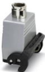
Coupling housing, with single locking latch, height 52 mm, with screw connection, 1x Pg16

Please be informed that the data shown in this PDF Document is generated from our Online Catalog. Please find the complete data in the user's documentation. Our General Terms of Use for Downloads are valid ( http://phoenixcontact.com/download )