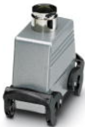
Sleeve housing, with double locking latch, height 76 mm, with screw connection, 1x Pg21, straight cable entry

Please be informed that the data shown in this PDF Document is generated from our Online Catalog. Please find the complete data in the user's documentation. Our General Terms of Use for Downloads are valid ( http://phoenixcontact.com/download )