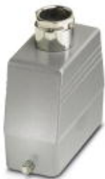
Sleeve housing, for single locking latch, height 76 mm, with screw connection, 1x Pg21, straight cable entry

Please be informed that the data shown in this PDF Document is generated from our Online Catalog. Please find the complete data in the user's documentation. Our General Terms of Use for Downloads are valid ( http://phoenixcontact.com/download )