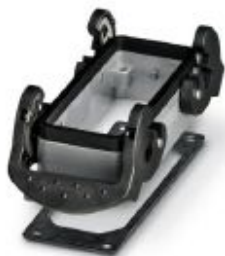
HEAVYCON B16 panel mounting base, with double locking latch, height: 29 mm, with flat gasket

Please be informed that the data shown in this PDF Document is generated from our Online Catalog. Please find the complete data in the user's documentation. Our General Terms of Use for Downloads are valid ( http://phoenixcontact.com/download )