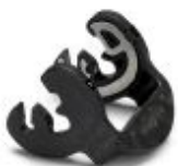
Replacement latch for HC-B10 / HC-B16/ HC-B24 housings with double locking latch (plastic design)

Double locking latch - HC-B 10-24-QB - 1637265