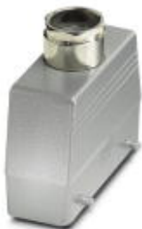
Sleeve housing, for double locking latch, height 76 mm, with screw connection, 1x Pg29, straight cable entry

Please be informed that the data shown in this PDF Document is generated from our Online Catalog. Please find the complete data in the user's documentation. Our General Terms of Use for Downloads are valid ( http://phoenixcontact.com/download )