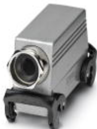
Sleeve housing, with double locking latch, height 76 mm, with screw connection, 1x Pg29, lateral cable entry

Please be informed that the data shown in this PDF Document is generated from our Online Catalog. Please find the complete data in the user's documentation. Our General Terms of Use for Downloads are valid ( http://phoenixcontact.com/download )