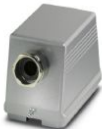
Sleeve housing, for single locking latch, height 96 mm, with screw connection, 1x Pg29, lateral cable entry

Please be informed that the data shown in this PDF Document is generated from our Online Catalog. Please find the complete data in the user's documentation. Our General Terms of Use for Downloads are valid ( http://phoenixcontact.com/download )