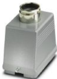
Sleeve housing, for single locking latch, height 96 mm, with screw connection, 1x Pg29, straight cable entry

Please be informed that the data shown in this PDF Document is generated from our Online Catalog. Please find the complete data in the user's documentation. Our General Terms of Use for Downloads are valid ( http://phoenixcontact.com/download )