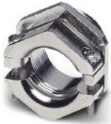
Pressure screws, with strain relief clamps, nickel-plated brass, clamping area 19 mm ... 27 mm, type Pg29

Please be informed that the data shown in this PDF Document is generated from our Online Catalog. Please find the complete data in the user's documentation. Our General Terms of Use for Downloads are valid ( http://phoenixcontact.com/download )