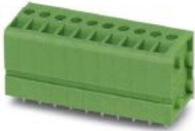
The figure shows the 10-position version

Please be informed that the data shown in this PDF Document is generated from our Online Catalog. Please find the complete data in the user's documentation. Our General Terms of Use for Downloads are valid ( http://phoenixcontact.com/download )