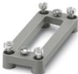
D-SUB adapter plate, for one D-SUB connector, no. of positions 25, housing series HC-D 15...

Please be informed that the data shown in this PDF Document is generated from our Online Catalog. Please find the complete data in the user's documentation. Our General Terms of Use for Downloads are valid ( http://phoenixcontact.com/download )