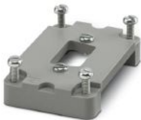
D-SUB adapter plate, for one D-SUB connector, no. of positions 9, housing series HC-B 6...

Please be informed that the data shown in this PDF Document is generated from our Online Catalog. Please find the complete data in the user's documentation. Our General Terms of Use for Downloads are valid ( http://phoenixcontact.com/download )