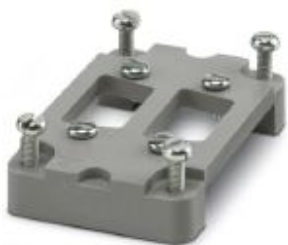
D-SUB adapter plate, for two D-SUB connectors, no. of positions 9, housing series HC-B 6...

Please be informed that the data shown in this PDF Document is generated from our Online Catalog. Please find the complete data in the user's documentation. Our General Terms of Use for Downloads are valid ( http://phoenixcontact.com/download )