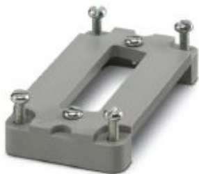
D-SUB adapter plate, for one D-SUB connector, no. of positions 25, housing series HC-B 10...

Please be informed that the data shown in this PDF Document is generated from our Online Catalog. Please find the complete data in the user's documentation. Our General Terms of Use for Downloads are valid ( http://phoenixcontact.com/download )