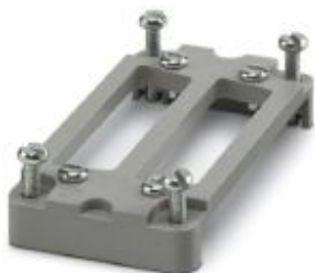
D-SUB adapter plate, for two D-SUB connectors, no. of positions 25, housing series HC-B 10...

Please be informed that the data shown in this PDF Document is generated from our Online Catalog. Please find the complete data in the user's documentation. Our General Terms of Use for Downloads are valid ( http://phoenixcontact.com/download )