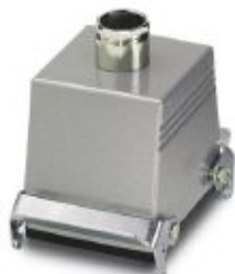
Coupling housing, with double locking latch, height 82 mm, with screw connection, 1x Pg29

Please be informed that the data shown in this PDF Document is generated from our Online Catalog. Please find the complete data in the user's documentation. Our General Terms of Use for Downloads are valid ( http://phoenixcontact.com/download )