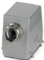
Sleeve housing, for double locking latch, height 76 mm, with screw connection, 1x Pg21, lateral cable entry

Please be informed that the data shown in this PDF Document is generated from our Online Catalog. Please find the complete data in the user's documentation. Our General Terms of Use for Downloads are valid ( http://phoenixcontact.com/download )