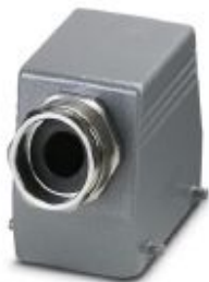
Sleeve housing, for double locking latch, height 76 mm, with screw connection, 1x Pg29, lateral cable entry

Please be informed that the data shown in this PDF Document is generated from our Online Catalog. Please find the complete data in the user's documentation. Our General Terms of Use for Downloads are valid ( http://phoenixcontact.com/download )