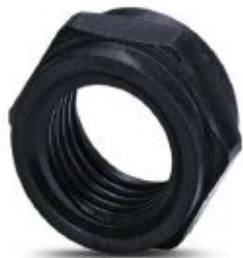
Photovoltaic connector, Range of articles: SUNCLIX, Nut, number of positions: 0

Please be informed that the data shown in this PDF Document is generated from our Online Catalog. Please find the complete data in the user's documentation. Our General Terms of Use for Downloads are valid ( http://phoenixcontact.com/download )