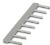
Insertion bridge, number of positions: 8, color: gray

Insertion bridge - EB 8- KDS 3-SI - 1780125