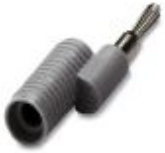
Reducing plug, color: gray