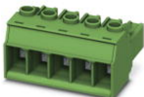
The figure shows a 5-pos. version of the product

PCB connector, nominal current: 41 A, rated voltage (III/2): 1000 V, number of positions: 4, pitch: 7.62 mm, connection method: Screw connection with tension sleeve, color: green, contact surface: Tin