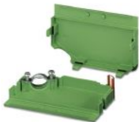
Cable housing, pitch: 0 mm, number of positions: 9, dimension a: 45 mm, color: green

Please be informed that the data shown in this PDF Document is generated from our Online Catalog. Please find the complete data in the user's documentation. Our General Terms of Use for Downloads are valid ( http://phoenixcontact.com/download )