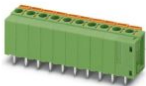
The figure shows the 10-position version

PCB terminal block, nominal current: 15 A, rated voltage (III/2): 400 V, nominal cross section: 1.5 mm 2 , pitch: 5.08 mm, number of positions: 7, connection method: Push-in spring connection, mounting: Wave soldering, conductor/PCB connection direction: 90 °, color: green, Pin layout: Linear pinning, Solder pin [P]: 3.4 mm. Item with securing pin at the end terminal block