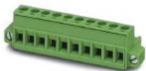
The figure shows a 10-position version of the product

PCB connector, nominal current: 12 A, nominal cross section: 2.5 mm 2 , number of positions: 11, pitch: 5.08 mm, connection method: Screw connection with tension sleeve, color: green, contact surface: Tin