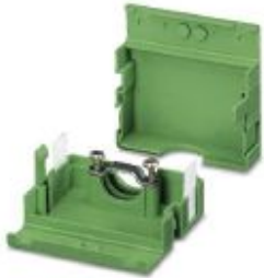
Cable housing, pitch: 0 mm, number of positions: 5, color: green

Please be informed that the data shown in this PDF Document is generated from our Online Catalog. Please find the complete data in the user's documentation. Our General Terms of Use for Downloads are valid ( http://phoenixcontact.com/download )