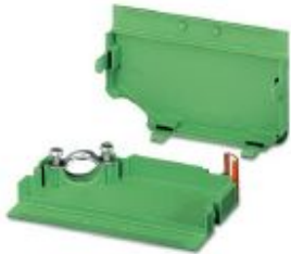
Cable housing, pitch: 0 mm, number of positions: 19, dimension a: 95 mm, color: green

Please be informed that the data shown in this PDF Document is generated from our Online Catalog. Please find the complete data in the user's documentation. Our General Terms of Use for Downloads are valid ( http://phoenixcontact.com/download )