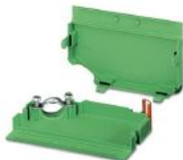
Cable housing, pitch: 0 mm, number of positions: 20, dimension a: 100 mm, color: green

Please be informed that the data shown in this PDF Document is generated from our Online Catalog. Please find the complete data in the user's documentation. Our General Terms of Use for Downloads are valid ( http://phoenixcontact.com/download )