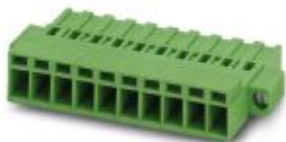
The figure shows an 10-position version

PCB connector, nominal current: 12 A, rated voltage (III/2): 320 V, nominal cross section: 2.5 mm 2 , number of positions: 5, pitch: 5.08 mm, connection method: Crimp connection, color: green, Corresponding female crimp contacts with current [A] and conductor cross section range [mm 2 ] data: 10A/MSTBC-MT 0,5-1,0 (3190564); 10A/MSTBC-MT 0,5-1,0 BA (3190645); 12A/MSTBC-MT 1,5-2,5 (3190551); 12A/MSTBC-MT 1,5-2,5 BA (3190658). BA = Bandkontakte