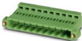
The figure shows an 10-position version

PCB connector, nominal current: 12 A, rated voltage (III/2): 320 V, nominal cross section: 2.5 mm 2 , number of positions: 20, pitch: 5.08 mm, connection method: Crimp connection, color: green, Corresponding male crimp contacts with current [A] and conductor cross section range [mm 2 ] data: 10A/ICC-MT 0,5-1,0 (3190577); 10A/ICC-MT 0,5-1,0 BA (3190603); 12A/ICC-MT 1,5-2,5 (3190580); 12A/ICC-MT 1,5-2,5 BA (3190593). BA = Bandkontakte