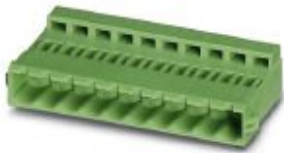
The figure shows an 10-position version

Please be informed that the data shown in this PDF Document is generated from our Online Catalog. Please find the complete data in the user's documentation. Our General Terms of Use for Downloads are valid ( http://phoenixcontact.com/download )