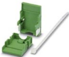
Cable housing, pitch: 3.81 mm, number of positions: 5, dimension a: 21.44 mm, color: green

Please be informed that the data shown in this PDF Document is generated from our Online Catalog. Please find the complete data in the user's documentation. Our General Terms of Use for Downloads are valid ( http://phoenixcontact.com/download )