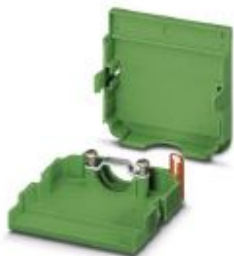
Cable housing, pitch: 3.81 mm, number of positions: 8, dimension a: 32.87 mm, color: green

Please be informed that the data shown in this PDF Document is generated from our Online Catalog. Please find the complete data in the user's documentation. Our General Terms of Use for Downloads are valid ( http://phoenixcontact.com/download )