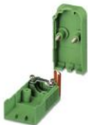
Cable housing, pitch: 0 mm, number of positions: 3, dimension a: 24.66 mm, color: green

Please be informed that the data shown in this PDF Document is generated from our Online Catalog. Please find the complete data in the user's documentation. Our General Terms of Use for Downloads are valid ( http://phoenixcontact.com/download )