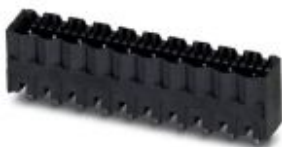
The figure shows a 10-position version of the product

PCB headers, nominal current: 12 A, rated voltage (III/2): 320 V, nominal cross section: 2.5 mm 2 , number of positions: 4, pitch: 5 mm, color: black, contact surface: Tin, mounting: THR soldering, pin layout: Linear pinning, solder pin [P]: 2 mm, User information and design recommendations for through hole reflow technology can be found under: Downloads