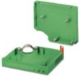
Cable housing, pitch: 0 mm, number of positions: 12, dimension a: 93.24 mm, color: green

Please be informed that the data shown in this PDF Document is generated from our Online Catalog. Please find the complete data in the user's documentation. Our General Terms of Use for Downloads are valid ( http://phoenixcontact.com/download )