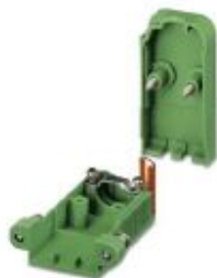
Cable housing, pitch: 0 mm, number of positions: 5, dimension a: 39.9 mm, color: green

Please be informed that the data shown in this PDF Document is generated from our Online Catalog. Please find the complete data in the user's documentation. Our General Terms of Use for Downloads are valid ( http://phoenixcontact.com/download )