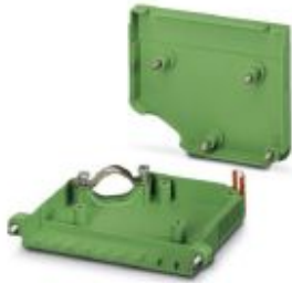
Cable housing, pitch: 0 mm, number of positions: 6, dimension a: 47.52 mm, color: green

Please be informed that the data shown in this PDF Document is generated from our Online Catalog. Please find the complete data in the user's documentation. Our General Terms of Use for Downloads are valid ( http://phoenixcontact.com/download )