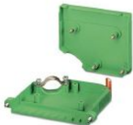
Cable housing, pitch: 0 mm, number of positions: 11, dimension a: 85.62 mm, color: green

Please be informed that the data shown in this PDF Document is generated from our Online Catalog. Please find the complete data in the user's documentation. Our General Terms of Use for Downloads are valid ( http://phoenixcontact.com/download )