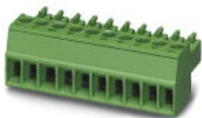
The figure shows a 10-position version of the product

PCB connector, nominal current: 8 A, number of positions: 12, pitch: 3.81 mm, connection method: Screw connection with tension sleeve, color: black, contact surface: Tin