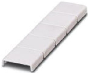
Marker labels, unprinted, 5-section, for individual labeling with M-PEN or CMS system, white

Please be informed that the data shown in this PDF Document is generated from our Online Catalog. Please find the complete data in the user's documentation. Our General Terms of Use for Downloads are valid ( http://phoenixcontact.com/download )