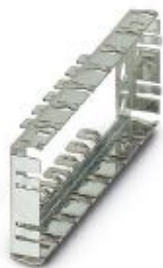
EMC shield adapter, for EMC connector, type 4, number of insert modules 5

Please be informed that the data shown in this PDF Document is generated from our Online Catalog. Please find the complete data in the user's documentation. Our General Terms of Use for Downloads are valid ( http://phoenixcontact.com/download )